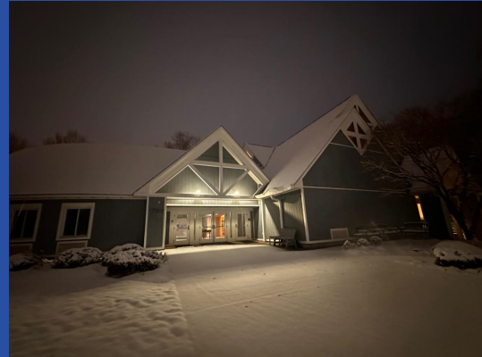
St. Anne's basking in the beautiful snow on Tuesday evening.

St. Anne's office will be closed on Monday, Feb. 17. If you have a pastoral emergency, please call the church office and a staff member will connect with you.