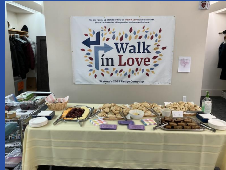
Thank you to the Sunday School students who provided the delicious pretzels during Java Junction on Lenten Pretzel Sunday! Such a fun tradition at St. Anne's!