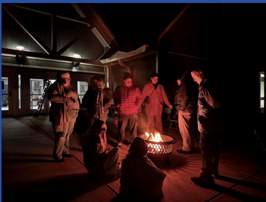
Gathered 'round the fire at stargazing!