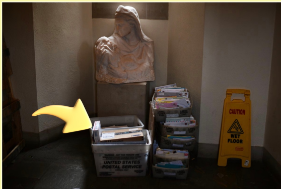
Another batch of letters at Washington National Cathedral for Bishop Mariann E. Budde.

Two Sundays ago, St. Anne's wrote letters and cards to Bishop Budde. They were mailed in one box to the Washington National Cathedral. On Tuesday of this week, there was an article in the Washington Post about Bishop Budde returning to the pulpit for the first time since her Inauguration sermon. This photo accompanied the article and we noticed that the post office box that the cards were sent in appears in the photo! Way to go, St. Anne's!